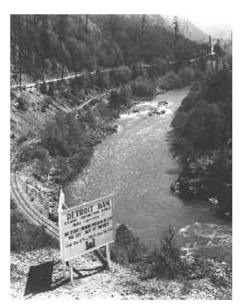
North Santiam River, before building of Detroit Reservoir, 1946.