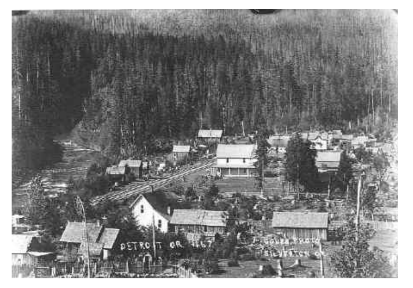
Detroit, Oregon before inundation by Detroit Reservoir. 1912.

While the above uncertainties and assumptions seem substantial, they are inherent in almost all model projections of large-scale environmental change. Even given these limitations, the results provide valuable insight into the overall resource patterns and trends likely to occur.