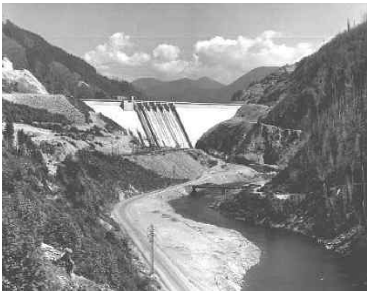
Detroit Dam, 1953.